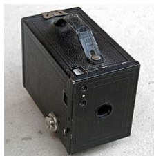
Kodak Brownie Camera, 1911