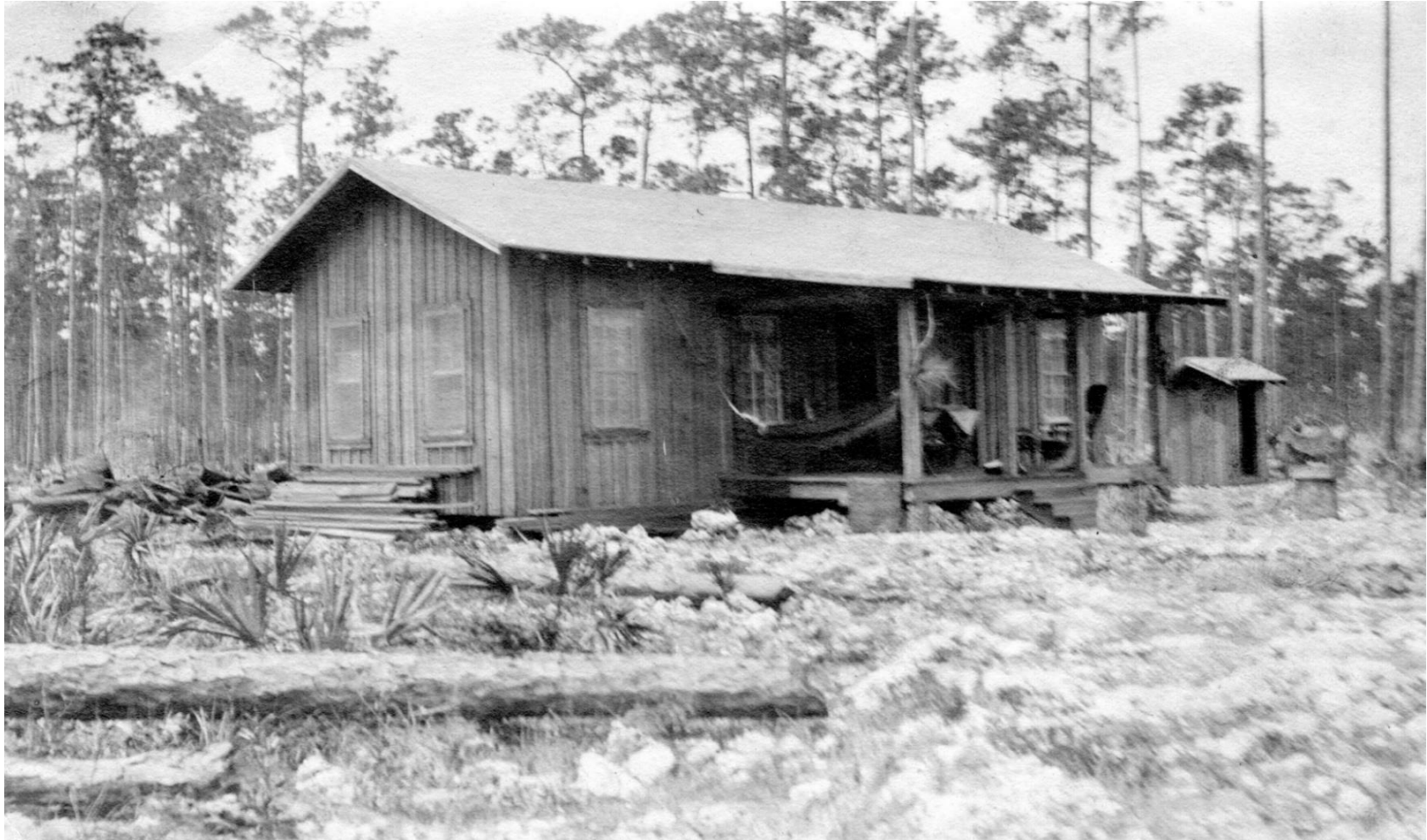
An Example of Larger House in Detroit