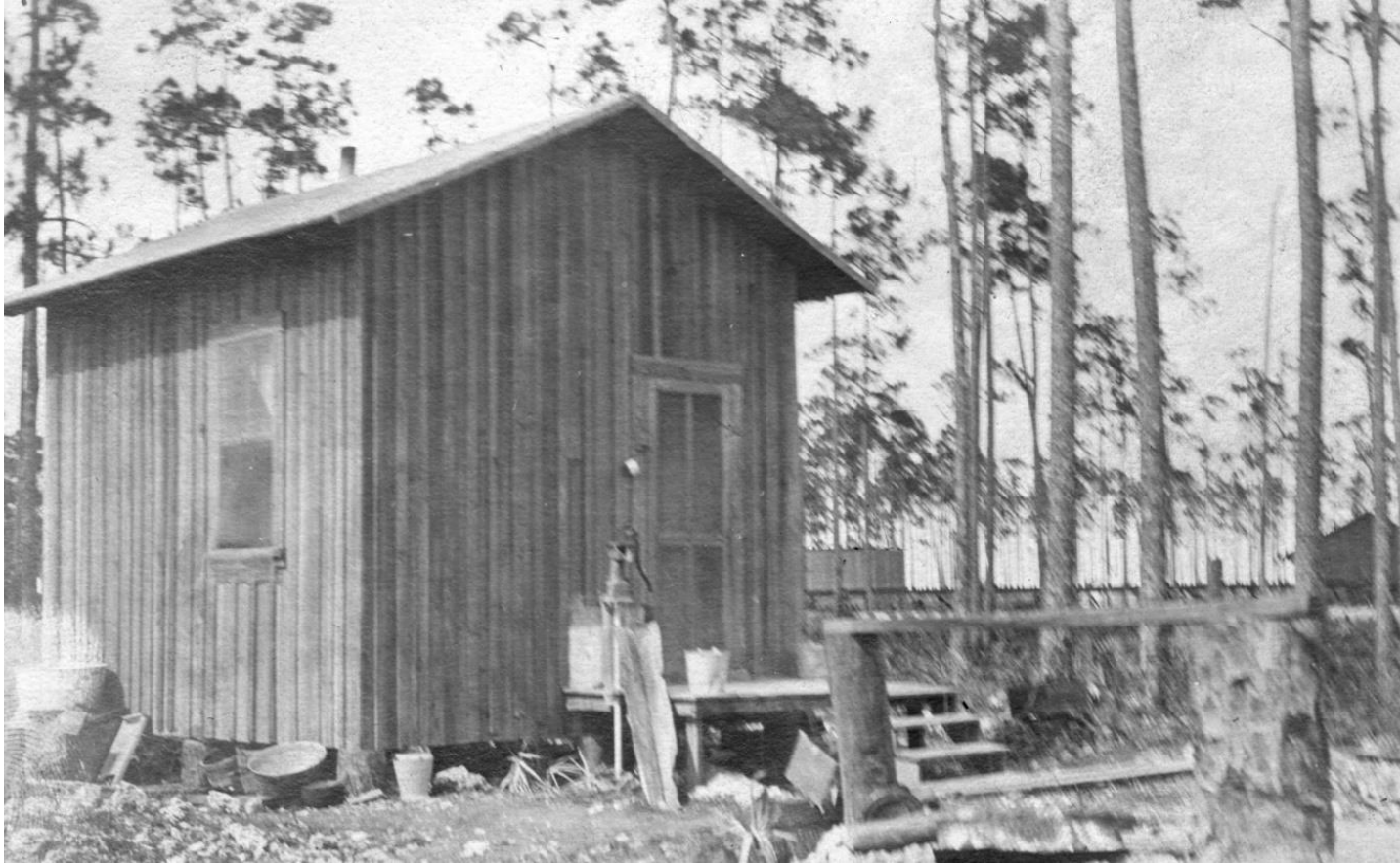
A Typical House in Early Detroit

Note the porch, pump, water trough, cups, pitcher, pails, washtub, and most likely a hitching post. The building appears to be about eight feet wide, with floor timbers supported by log posts. The house was not fancy, but it kept the mosquitoes at bay and provided shelter from the elements.