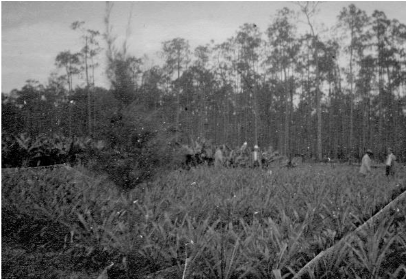
Field of Pineapples